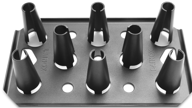
SPEEDY CHICKEN Mod. PS1108